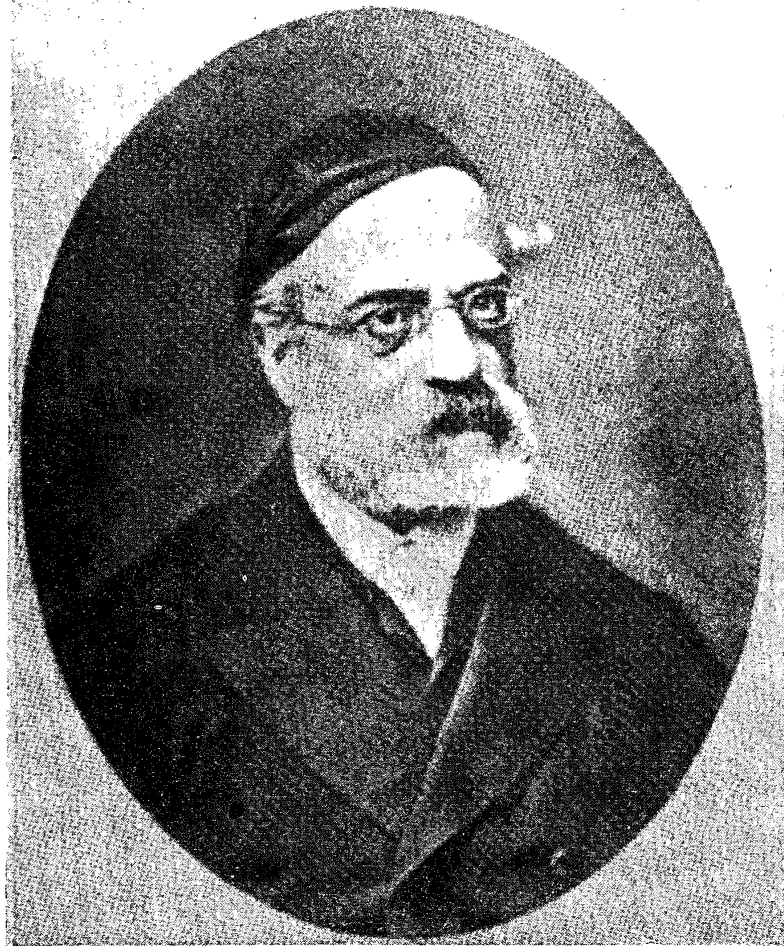
RABBI SAMSON RAPHAEL HIRSCH